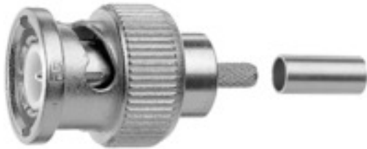
Fig. may differ

BNC Straight Plug Crimp G2 (RG-59 B/U) crimp/crimp Basic