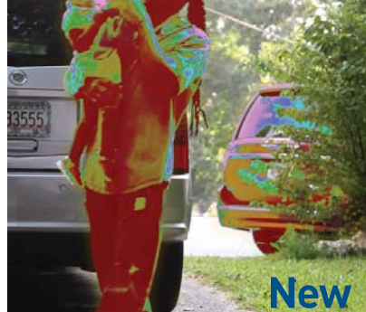
All movement, including objects that don't matter like leaves & trees, triggers motion detection & recording