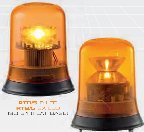
RTB/5 R LED RTB/5 8X LED ISO B1 (FLAT BASE)