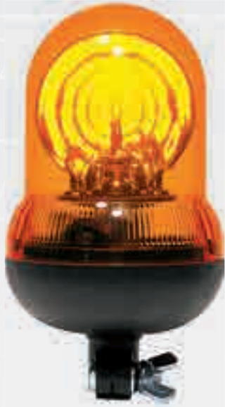
LR93 A ISO A BASE (MOUNT ON ADAPTER SOCKET)

> ECE R65 APPROVED < > EXCELLENT OPTICAL PERFORMANCE < > VERSATILE SOLUTIONS <