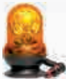
LR93 MV (MAGNETIC BASE, SUCTION PAD, HELIX CABLE AND CIGARETTE LIGHTER PLUG)