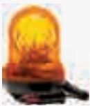
LR93 M ISO D BASE (MAGNETIC BASE, HELIX CABLE AND CIGARETTE LIGHTER PLUG)