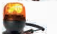
EUROROT MV (MAGNETIC BASE, SUCTION PAD, HELIX CABLE AND CIGARETTE LIGHTER PLUG)