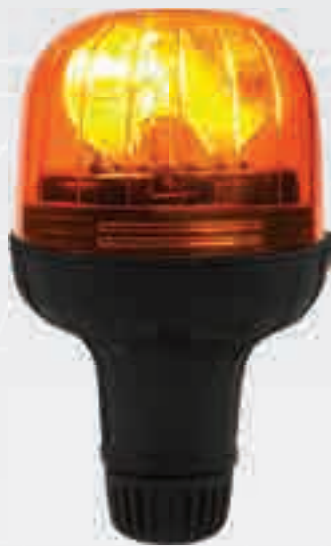
EUROROT FLX FLEXIBLE ISO A (MOUNT ON ADAPTER SOCKET) new