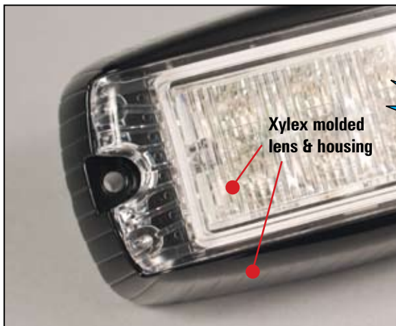
Raptor Single Surface Mount light is made with a durable & corrosion resistant Xylex lens & housing.