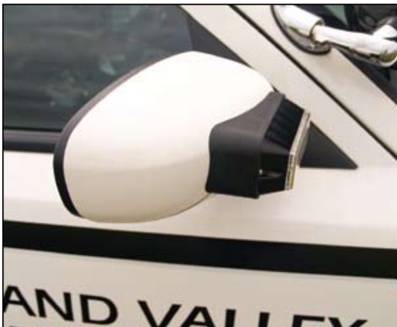
Vehicle specific Mirror Mount Grommets available. Dodge Charger Single Mirror Mount shown.