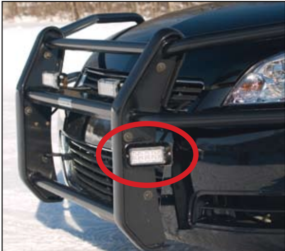
Single light mounted with optional 45° Bracket on a Chevrolet Impala Push Bumper