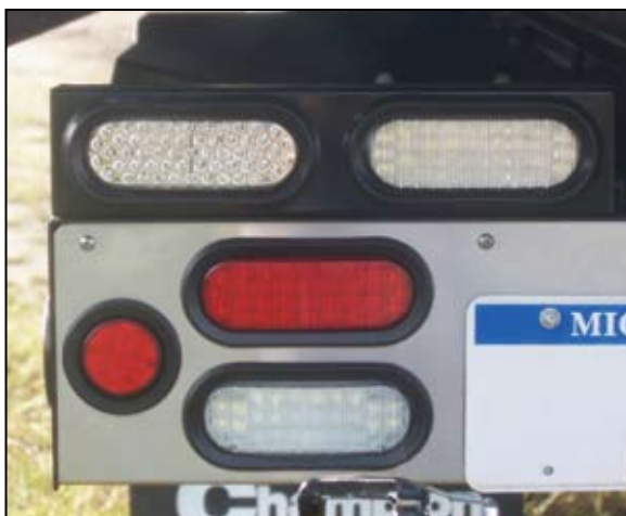
6" Oval Warning Light (top, left) with other SoundOff Signal LED lights, ask to see our Truck & Bus Catalog.