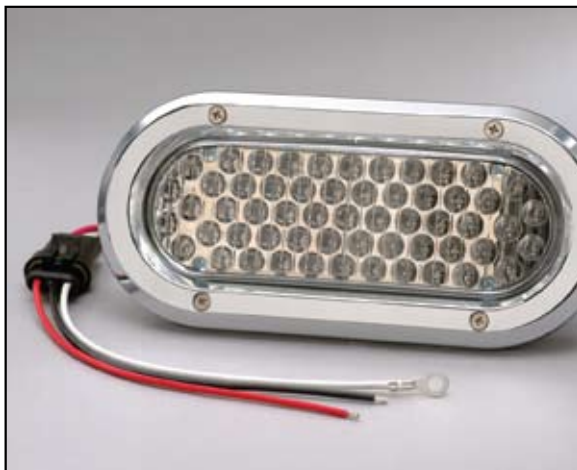
Stylish & rustproof optional chrome dress ring is available (order separately) complements other vehicle accessories.