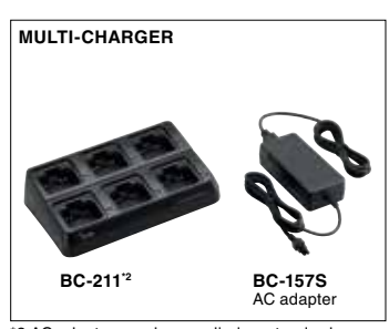
*2 AC adapter may be supplied as standard, depending on the version.