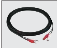
• OPC-441 SPEAKER EXTENSION CABLE 5.0m