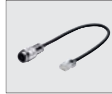
• OPC-589 MIC ADAPTER CABLE Allows you to connect an 8-pin microphone.