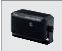
• SP-10 EXTERNAL SPEAKER