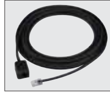
• OPC-440 MIC EXTENSION CABLE 5.0m