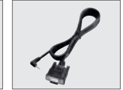
• OPC-1529R DATA COMMUNICATION CABLE Allows you data communication in DV mode and PC cloning with CS-2820.