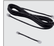
• OPC-1663, OPC-1712 SEPARATION CABLES OPC-1663: 3.4m OPC-1712: 10cm Same as supplied.