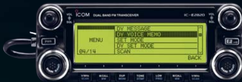
Symmetric layout and easy-to-read graphical interface

viewable over a wide angle. Push the "Function" button to call up the assigned functions menu on the display. In addition, tuning knobs and buttons for each band are arranged side-by-side, providing intuitive operation.