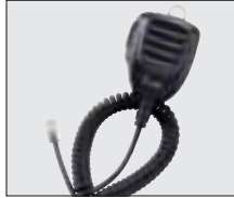
• HM-154 HAND MICROPHONE Regular hand microphone.