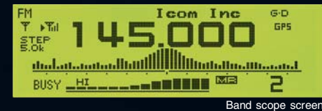
Band scope screen

The band scope function lets you watch conditions near the receiving frequency and visually assists in finding other stations.