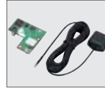
• UT-123 DIGITAL/GPS UNIT Provides D-STAR DV mode and GPS capabilities.