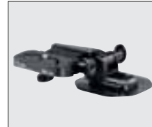
• MB-65 MOUNT BASE Mounts the remote control head. Angle and direction is adjustable.