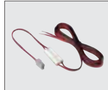
• OPC-1132A, OPC-347 DC POWER CABLES OPC-1132A: 3.0m OPC-347: 7.0m