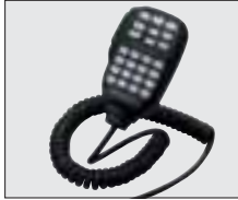
• HM-133 REMOTE CONTROL MICROPHONE Same as supplied.

Some options may not be available in some countries. Please ask your dealer for details.