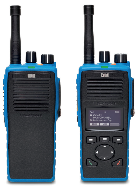
Non display model