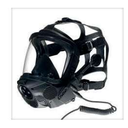
3rd Party BA Supports 3rd party BA comms kits