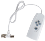
PFM820 UTC Controller