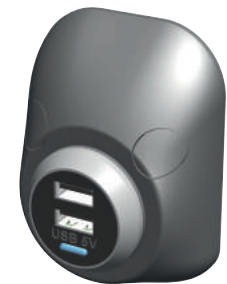
PVPro USB with P/N: USB-WPOD vertical mounting pod