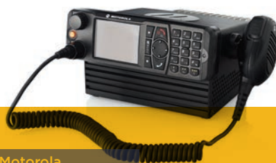
Motorola TMT800 TETRA