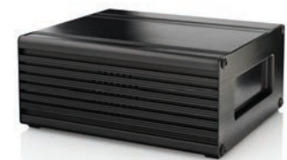
Radio Transceiver + Alfatronix Desktop Power Supply + Alfatronix Battery Back Up Box