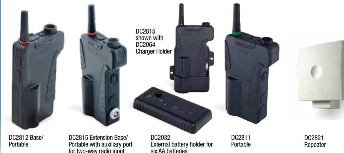
DC2812 Base/Portable DC2815 Extension Base/Portable with auxiliary port for two-way radio input DC2032 External battery holder for six AA batteries DC2811 Portable DC2821 Repeater