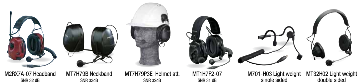
M2RX7A-07 Headband SNR 32 dB MT7H79B Neckband SNR 33dB MT7H79P3E Helmet att. SNR 32dB MT1H7F2-07 SNR 31 dB M701-H03 Light weight single sided MT32H02 Light weight double sided

A variety of options so you can select the right model for your workplace, see examples below.