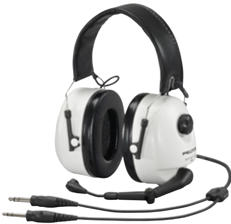
8006 MT51H79F-01 VI

Peltor Aviation 8006 headset has an ambient-noise cancelling electret differential microphone, specially designed for aviation intercom systems. The frequency range is adjusted for good speech recognition. The earphones have a broad frequency range for good sound reproduction. Straight polyurethane cord, moulded connectors and a stereo/mono switch in the branching box. The earphones are connected with a 1/4" stereo connector and the microphone has a PJ068 connector.