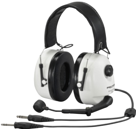
8003 MT52H79F-04 VI

Peltor Aviation 8003 headset has an ambient-noise cancelling microphone, specially designed for aviation intercom systems. The microphone amplifier can be adjusted for output signals in the range of 300–600 mV. The frequency range is adjusted for good speech recognition. The earphones have a broad frequency range for good sound reproduction. Straight polyurethane cord, moulded connectors and a stereo/mono switch in the branching box. The earphones are connected with a 1/4" stereo connector and the microphone has a PJ068 connector.